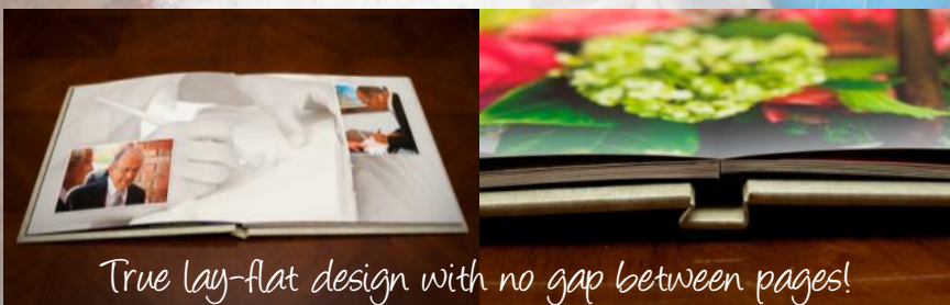
True lay-flat design with no gap between pages!

All albums come with a minimum of 15 panoramic spreads (30 pages). Standard Albums can have a maximum of 45 spreads (90 pages), and Deluxe Albums max out at 25 spreads (50 pages) due to page thickness.